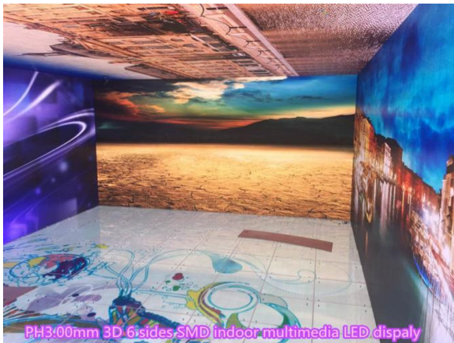
PH3.00mm 3D 6-sides SMD indoor multimedia LED display