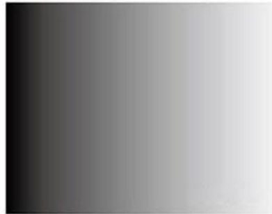
good display performance with low grayscale