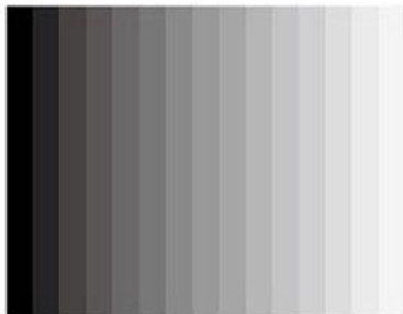
Poor display performance with low grayscale

The LED Screen is manufactured by using best quality material, purchased from most reputed vendors. The final products feature supreme quality and offers best outputs. High refresh rate and 16bit gray scale ensures the picture quality remains seamless.