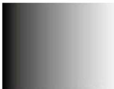
good display performance with low grayscale