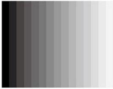
Poor display performance with low grayscale