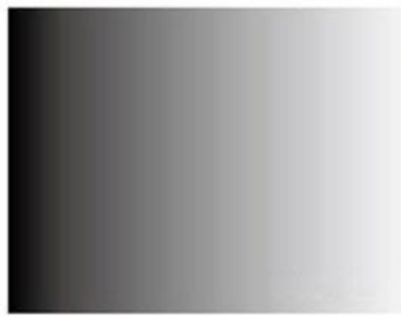
good display performance with low grayscale