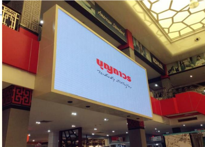
Road, Songjiang, Shanghai 201613, China